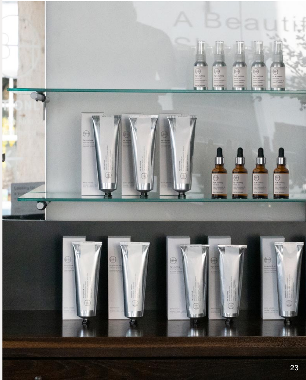
Fig & Nutmeg / ASF92