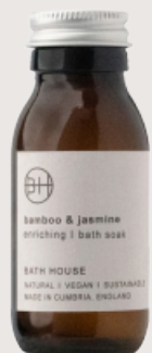
HABA42 Bath Soak