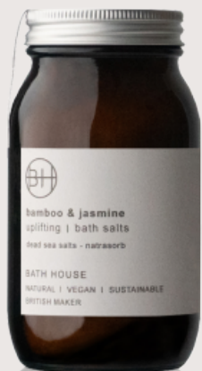
Bath Salts 175g

A customer favourite, our bath salts offer guests a traditional bathing experience. These mineral-rich salts scent and soften bath water, soothing tired muscles and rehydrating the skin.