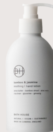
Hand Lotion 300ml