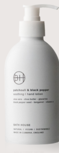
Hand Lotion 300ml