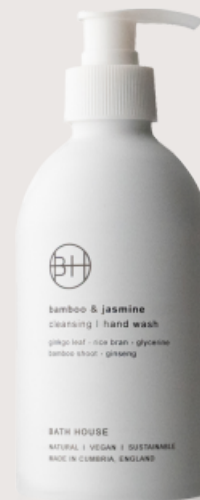
Hand Wash 300ml