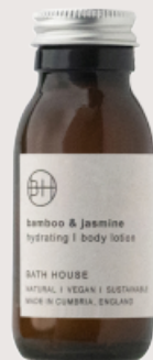
HABA41 Body Lotion