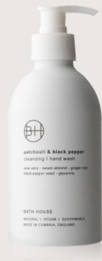
Hand Wash 300ml