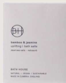
Bath Salts 60g