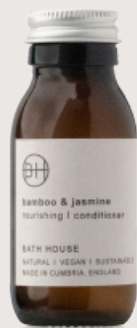
HABA49 Conditioner Contains Sweet Almond Oil.