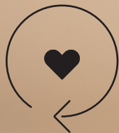
The 300ml Bottle

Aluminium can be endlessly recycled, with 75% of all the aluminium used is still in use today.