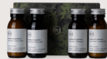
HABA252 Experience Set - 4 x 60ml Bamboo & Jasmine 60ml shampoo + 60ml conditioner 60ml body wash + 60ml body lotion Conditioner contains Sweet Almond Oil.