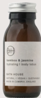
HABA41 Body Lotion