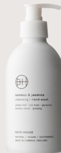
Hand Wash 300ml