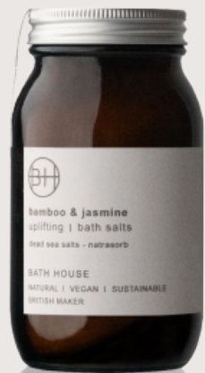
Bath Salts 175g

A customer favourite, our bath salts offer guests a traditional bathing experience. These mineral-rich salts scent and soften bath water, soothing tired muscles and rehydrating the skin.