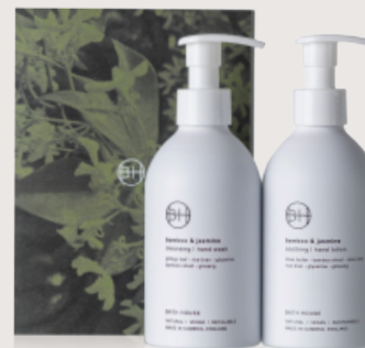
HABA254 Handcare Duo (2 x 300ml) Bamboo & Jasmine 300ml hand wash + 300ml hand lotion