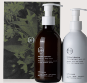
HABA255 Bodycare Duo (2 x 300ml) Bamboo & Jasmine 300ml hand wash + 300ml hand lotion