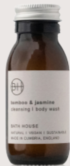
HABA51 Body Wash

The 60ml brown bottles are made from strong, pharmaceutical-grade glass, sourced in the UK, they are a recyclable alternative to single-use plastic. They are filled adequately to include several uses for the guest.