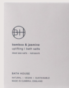
Bath Salts 60g