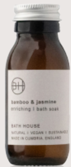
HABA42 Bath Soak