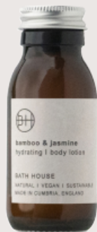
HABA48 Hair & Body Wash