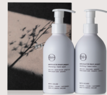
HAPB254 Handcare Duo (2 x 300ml) Patchouli & Black Pepper 300ml hand wash + 300ml hand lotion Contains Walnut extract and Sweet Almond Oil.