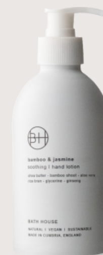
Hand Lotion 300ml