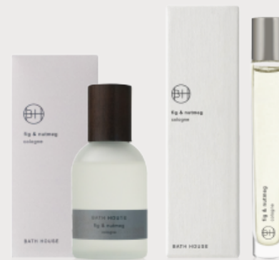
Fig & Nutmeg

Fruity and woody, with notes of juicy fig, iris and chamomile layered with nutmeg, clove, sandalwood and smoky patchouli.