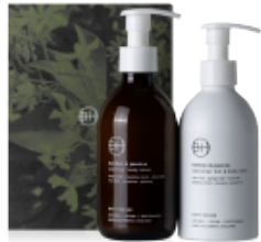
Bodycare Set / ABA255 Bamboo & Jasmine 300ml body wash 300ml body lotion