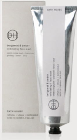
Face Wash / 100ml Deeply cleansing and anti-bacterial, with a mild exfoliating action.

Gentle skincare made with active, natural ingredients to promote skin health. Created to be used as part of the daily skincare routine, suitable for all skin types.