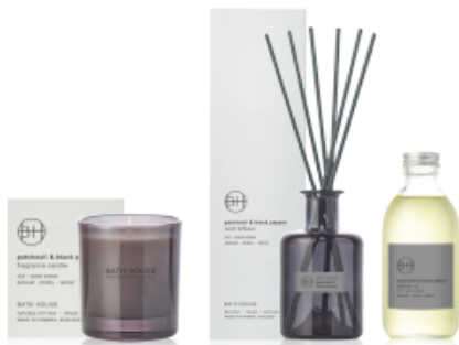
Fragrance Candle 200g / ACPB01