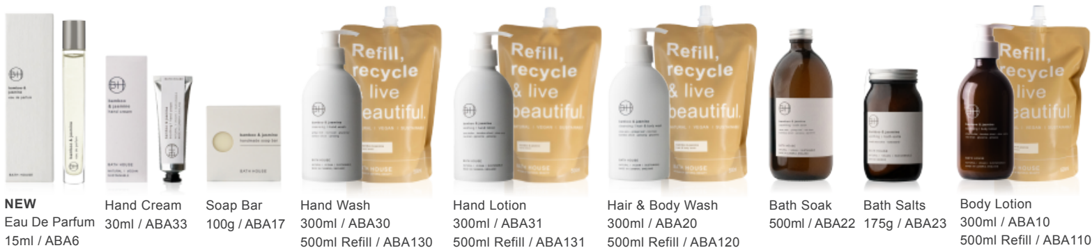
NEW Eau De Parfum 15ml / ABA6 Hand Cream 30ml / ABA33 Soap Bar 100g / ABA17 Hand Wash 300ml / ABA30 500ml Refill / ABA130 Hand Lotion 300ml / ABA31 500ml Refill / ABA131 Hair & Body Wash 300ml / ABA20 500ml Refill / ABA120 Bath Soak 500ml / ABA22 Bath Salts 175g / ABA23 Body Lotion 300ml / ABA10 500ml Refill / ABA110