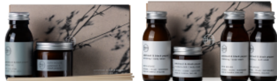
Home Fragrance Set / ACPB20 60ml room diffuser 60g fragrance candle reeds