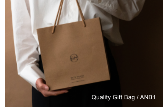
Quality Gift Bag / ANB1

Gift a selection of artisan-made body, bathing and skincare products. All beautifully fragranced, beneficial formulations for the body and mind.