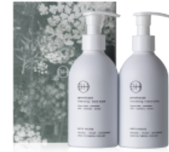
Handcare Set / AGR254 Greenhouse 300ml hand wash 300ml hand lotion