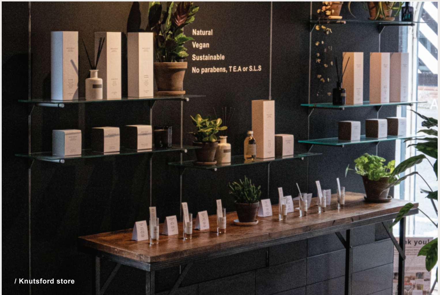
/ Knutsford store