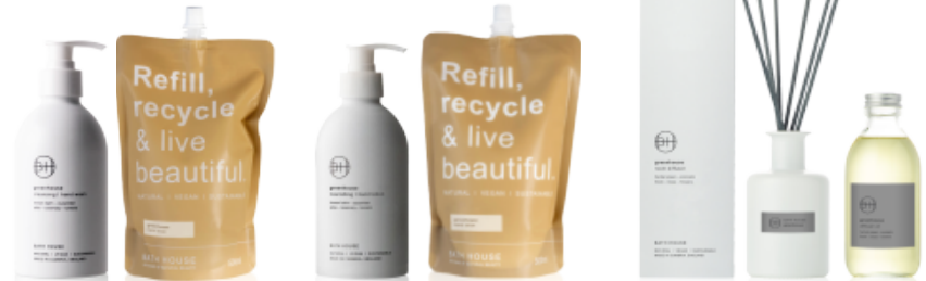
Hand Wash 300ml / AGR30 500ml Refill / AGR130

Herbal Green / Aromatic / Fresh / Moss / Flowers