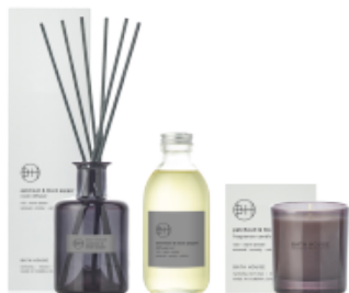
Patchouli & Black Pepper Room Diffuser 200ml / ADPB01 Room Diffuser Refill 200ml / ADPB02 Fragrance Candle 200g / ACPB01