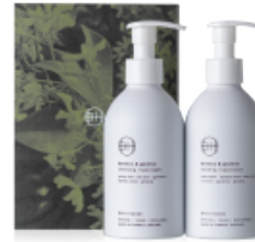
Handcare Set / ABA254 Bamboo & Jasmine 300ml hand wash 300ml hand lotion