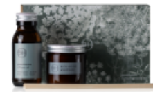
Home Fragrance Set / ACRG20 60g fragrance candle 60ml room diffuser