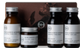
Experience Set / AVO252 30ml body cream + 60ml bath soak 60ml body wash + 60ml lotion