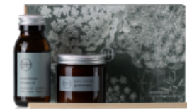
Home Fragrance Set / ACGR20 Greenhouse 60g fragrance candle 60ml room diffuser