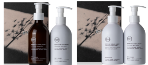
Bodycare Duo / APB255 300ml body wash 300ml body lotion