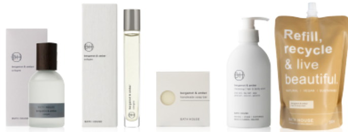
Cologne 100ml / ABE1 Cologne 15ml / ABE6 Soap Bar 100g / ABE17 Hair & Body Wash 300ml / ABE20 500ml Refill / ABE120