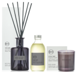
Winter Night Room Diffuser 200ml / ADWN01 Room Diffuser Refill 200ml / ADWN02 Fragrance Candle 200g / ACWN01