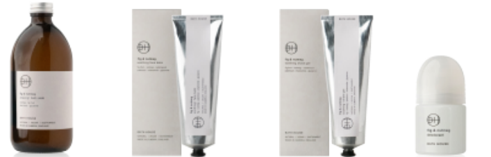
Bath Soak 500ml / ASF22 Face Balm 100ml / ASF60 Shave Gel 100ml / ASF61 Deodorant 50ml / ASF16