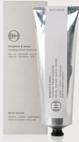
Facial Moisturiser / 100ml Light and easily absorbed, hydrates, revitalises and protects skin daily.