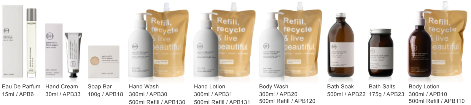
Eau De Parfum 15ml / APB6