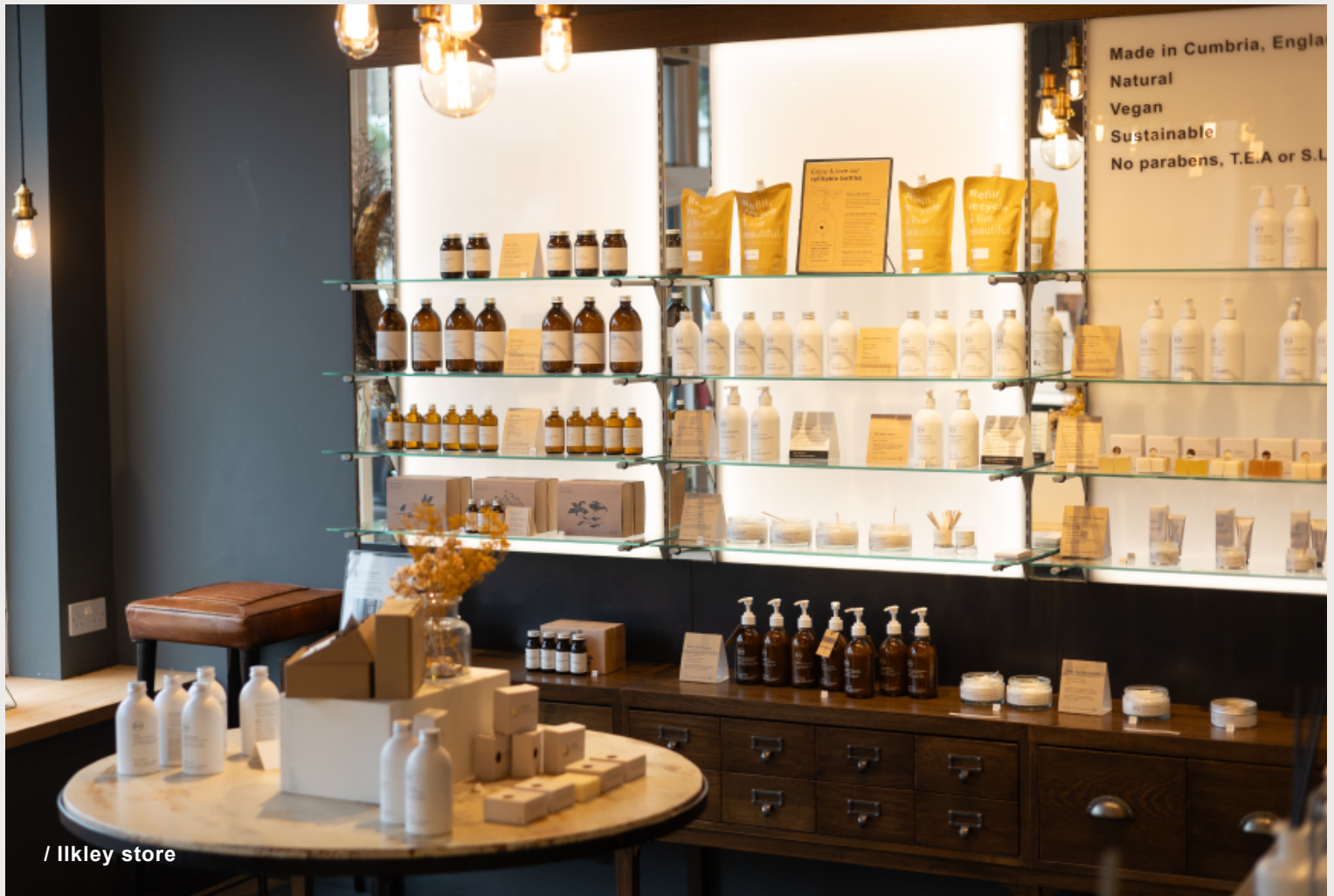
/ Ilkley store