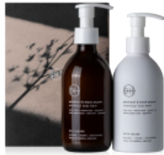
Bodycare Set / APB255 Patchouli & Black Pepper 300ml body wash 300ml body lotion