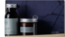
Home Fragrance Set / ACWN20 Winter Night 60g fragrance candle 60ml room diffuser