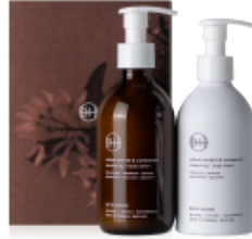
Bodycare Set / AVO255 Velvet Orchid & Cardamom 300ml body wash 300ml body lotion