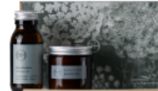
Home Fragrance Set / ACGR20 Greenhouse 60g fragrance candle 60ml room diffuser