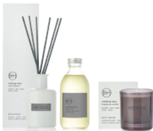
Climbing Trees Room Diffuser 200ml / ADCL01 Room Diffuser Refill 200ml / ADCL02 Fragrance Candle 200g / ACCL01