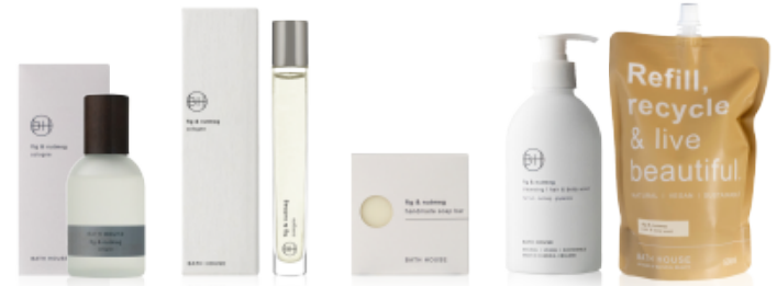
Cologne 100ml / ASF1 Cologne 15ml / ASF6 Soap Bar 100g / ASF17 Hair & Body Wash 300ml / ASF20 500ml Refill / ASF120