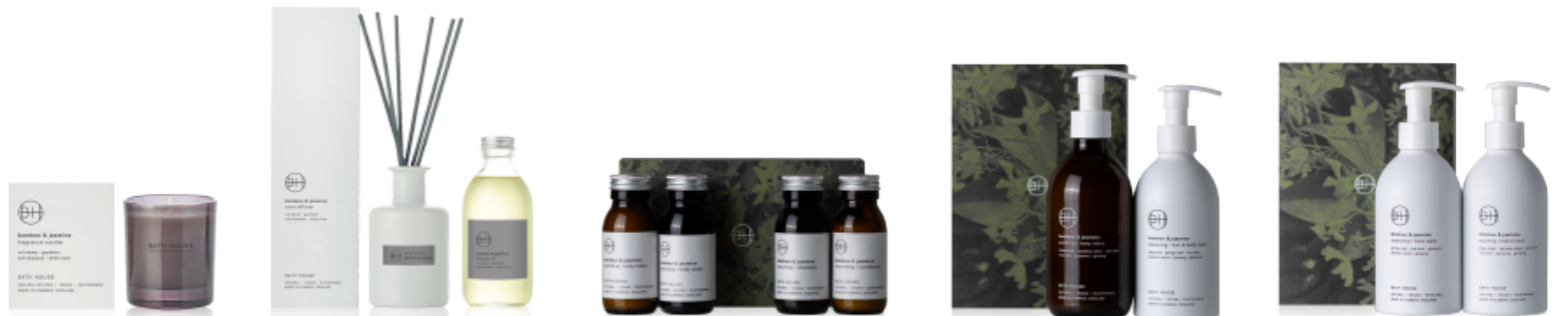
Fragrance Candle 200g / ACBJO1 Room Diffuser 200ml + vase + reeds / ADBJO1 200ml Refill / ADBJO2 Experience Set / ABA252 60ml shampoo + 60ml conditioner 60ml body lotion + 60ml body wash Bodycare Duo / ABA255 300ml body wash 300ml body lotion Handcare Duo / ABA254 300ml hand wash 300ml hand lotion