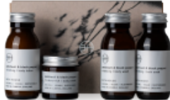
Experience Set / APB252 Patchouli & Black Pepper 30ml body cream 60ml bath soak 60ml body lotion 60ml body wash