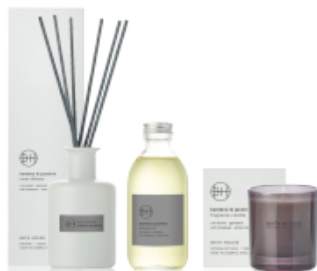
Bamboo & Jasmine Room Diffuser 200ml / ADBJ01 Room Diffuser Refill 200ml / ADBJ02 Fragrance Candle 200g / ACBJ01

Our candles and diffusers are infused with bespoke fragrances, inspired by scented memories of special places visited, landscapes imagined and moments remembered.