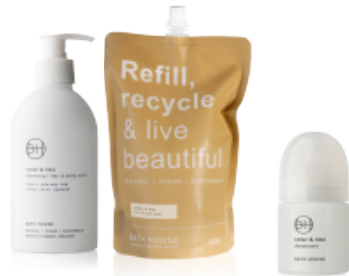
Hair & Body Wash 300ml / ACC20 500ml Refill / ACC120