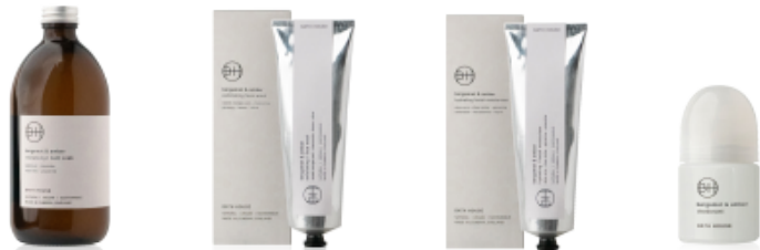
Bath Soak 500ml / ABE22 Face Wash 100ml / ABE63 Face Moisturiser 100ml / ABE62 Deodorant 50ml / ABE16