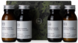
Experience Set / ABA252 Bamboo & Jasmine 60ml shampoo 60ml conditioner 60ml body lotion 60ml body wash