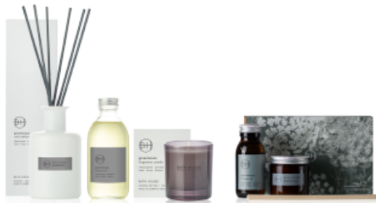
Greenhouse Room Diffuser 200ml / ADGR01 Room Diffuser Refill 200ml / ADGR02 Fragrance Candle 200g / ACRG01