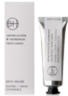
Hand Cream 30ml / AVO33