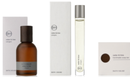
Cologne 100ml / ACC1