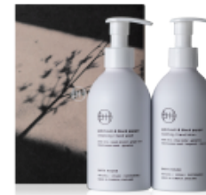
Handcare Set / APB254 Patchouli & Black Pepper 300ml hand wash 300ml hand lotion