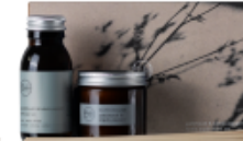
Home Fragrance Set / ACPB20 Patchouli & Black Pepper 60g fragrance candle 60ml room diffuser