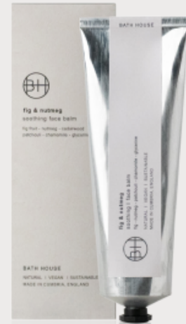
Fig & Nutmeg / ASF61

A dual action gel for a comfortable shave, nourishes the skin.