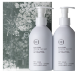
Handcare Duo / AGR254 300ml hand wash 300ml hand lotion