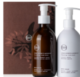
Bodycare Duo / AVO255 300ml body wash 300ml body lotion