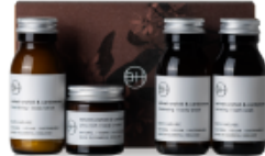
Experience Set / AVO252 Velvet Orchid & Cardamom 30ml body cream 60ml bath soak 60ml body lotion 60ml body wash